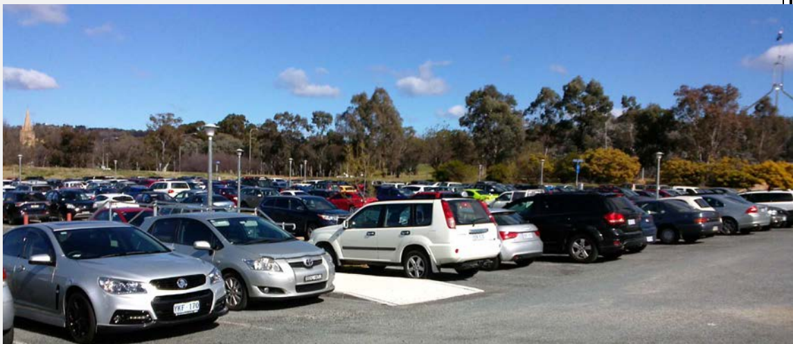
The Foreign Affairs building to the left makes it difficult to get the same location as the 1949 photo